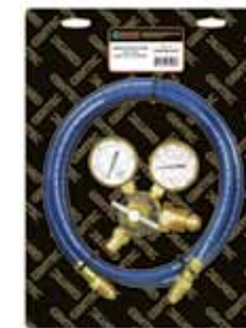
790AR-50-6HSP Flowgauge Regulator with 6' Hose