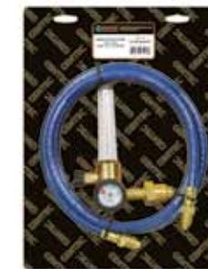
791AR-60-6HSP Flowgauge Regulator with 6' Hose