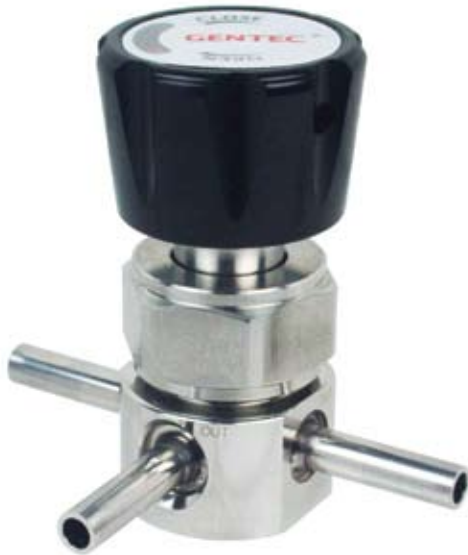
Manual (Low Pressure)