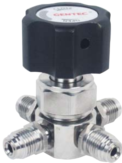
Manual (High Pressure)